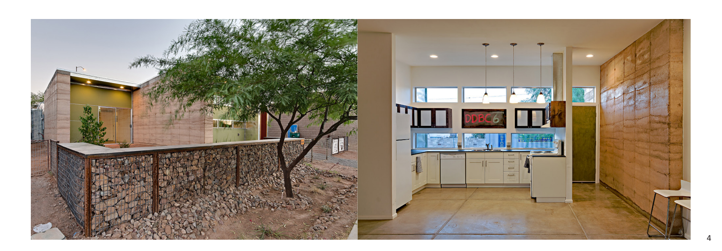
Figure 4: plit House; hybrid rammed earth thermal mass and insulative framed walls.